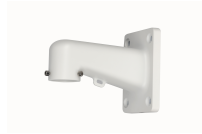
DH-PFB305W Wall mount bracket